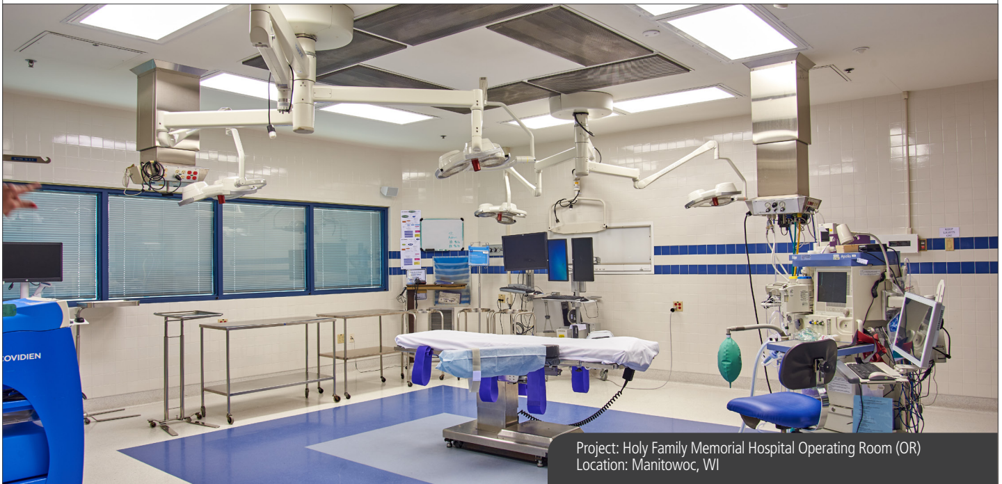
Project: Holy Family Memorial Hospital Operating Room (OR) Location: Manitowoc, WI

"We chose to partner with Indigo-Clean over other disinfecting technologies because of the ease of use and the proven efficacy of the disinfecting lights. We look forward to expanding our usage of Indigo-Clean in other areas of the hospital in the future."